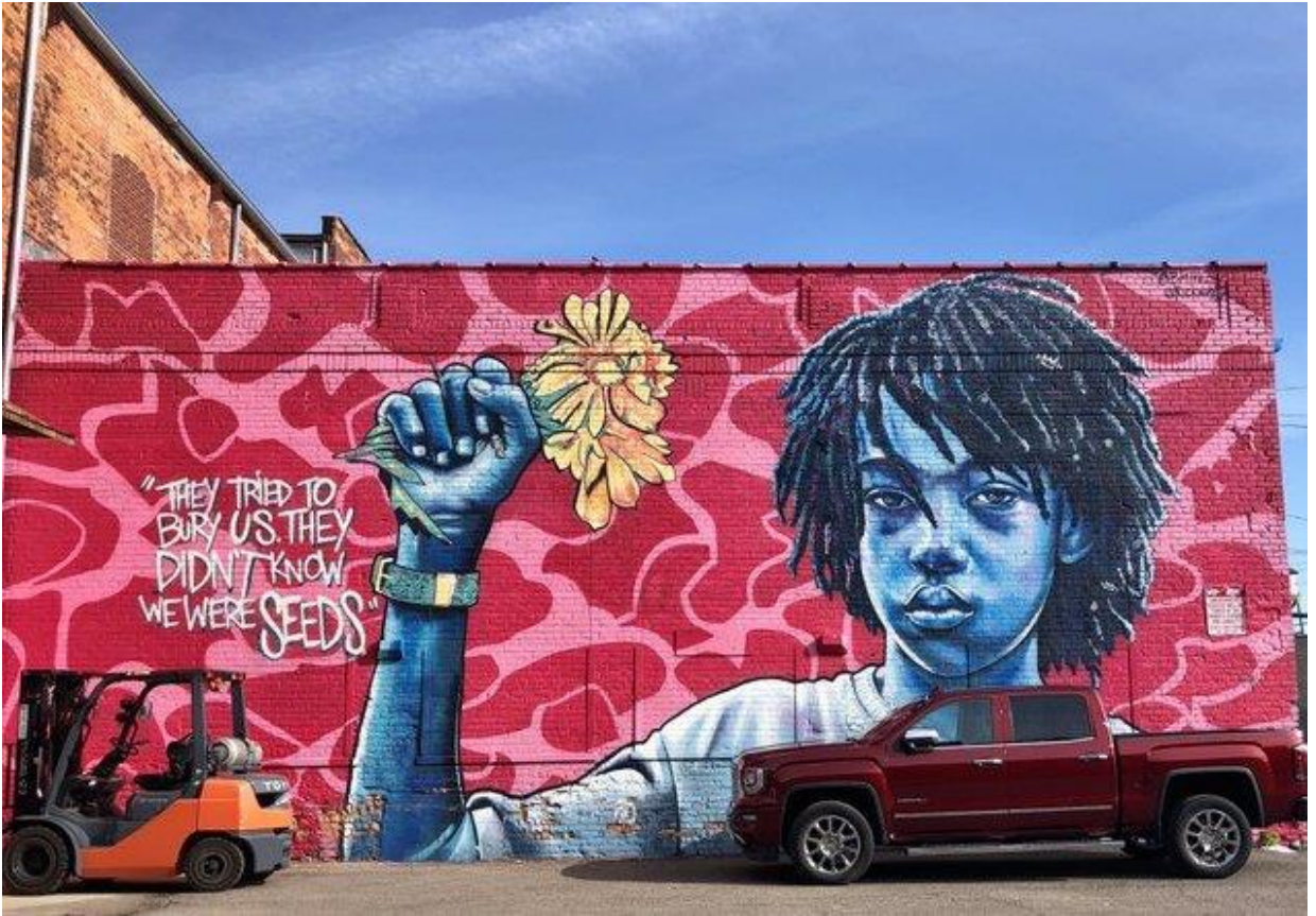
Mural at the Eastern Market, Detroit, MI

Congregational Church United Church of Christ